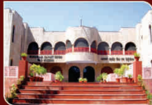
Maharaja Ranjit Singh Museum

Tourist & Travel Gowell Travels Gufran Ahmad Contact No - +91-99112-25119, +91-98115-57906, +91- 89583-68828